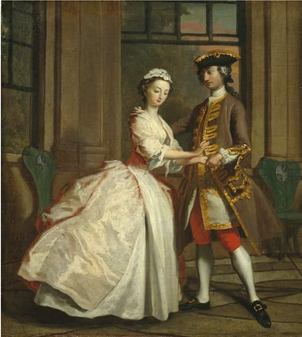
Image 1: “Pamela and Mr. B. in the summer house” (1743) by Joseph Highmore, oil on canvas.