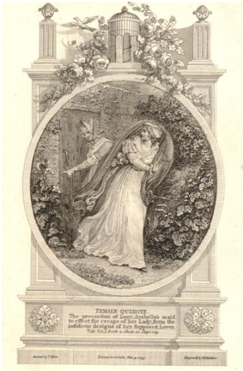
Image 2: "Female Quixote" (1799) by W. Hawkins after T. Kirk's painting for Cooke's Pocket Edition of Select Novels , engraving on paper.