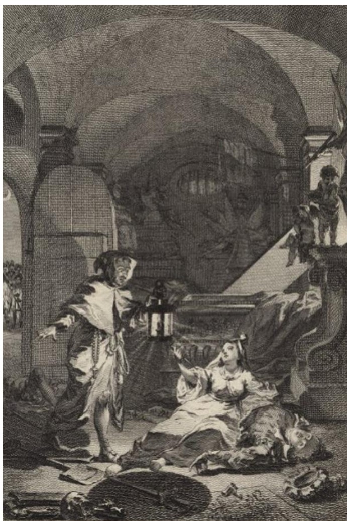
Figure 1: “Romeo & Juliet” (1754) by Anthony Walker, etching on paper.

cultural lexicon. From mid-century onward the character of Juliet frequently appeared in the periodical press not just in the many reviews of specific performances, although those were certainly plentiful, 10 but as a cultural touchstone in discussions